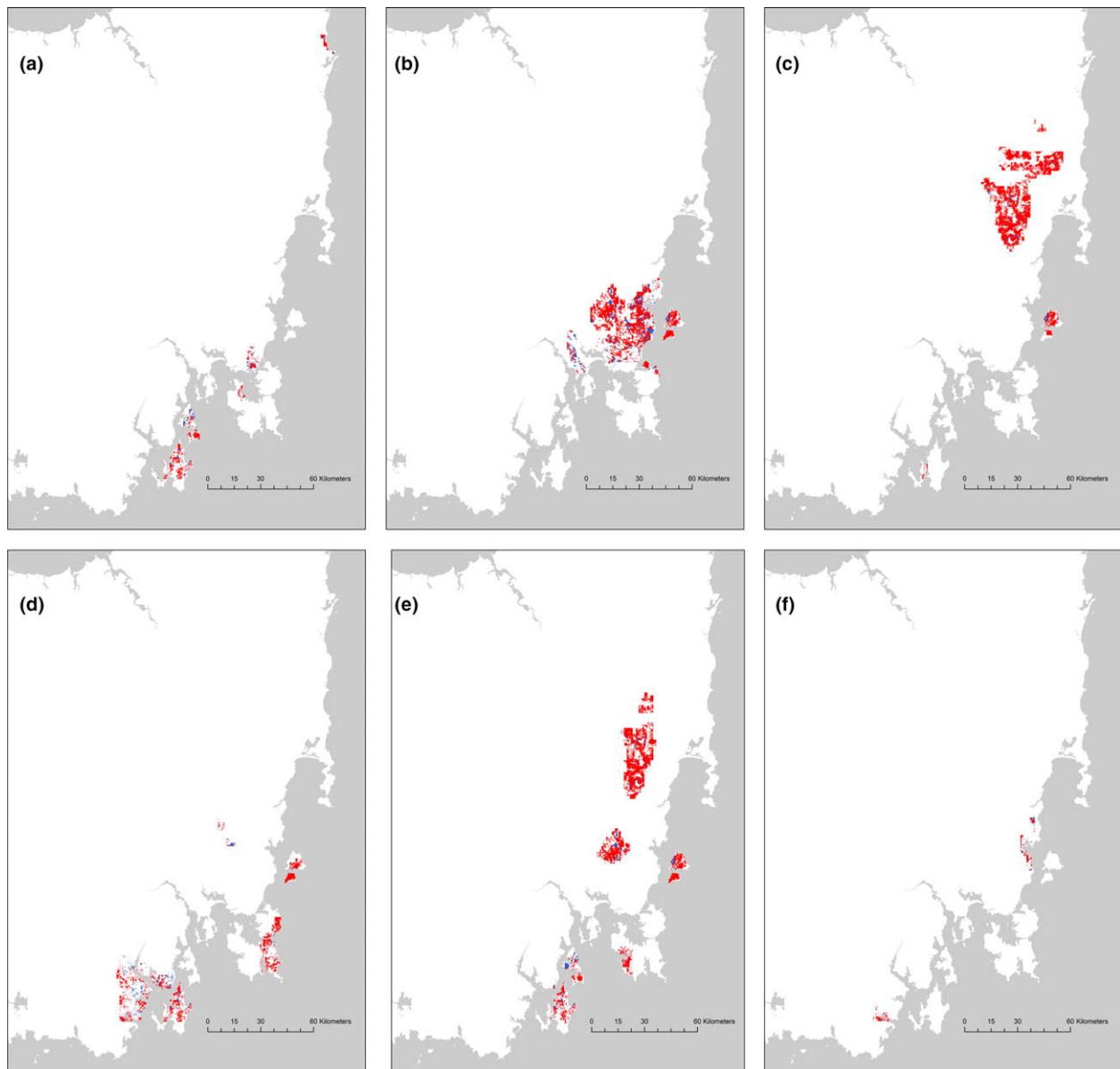
Figure 2 Location and area of habitat occupied by breeding swift parrots based on occupancy models (red = nesting habitat, blue = foraging habitat) in eastern Tasmania, Australia between (a) 2009, (b) 2010, (c) 2011, (d) 2012, (e) 2013 and (f) 2014. The location of nesting by the swift parrot population varies annually depending on where food is available, and <30% of the swift parrot population settles to breed on predator-free islands in any given year. Reproduced with permission from Webb et al. (2017).

batches with 1000 iterations per batch). We first treated the entire sample set as a single population representative of the entire species. We also performed separate analyses for island and mainland subsets. We combined the exact P values using Fisher's method and report the chi-square test across all loci and populations. We used GenAlEx 6.5 (Peakall & Smouse, 2006, 2012) to calculate allele frequencies, observed and expected heterozygosities, inbreeding coefficients, G -statistics, probability of identity ( PI ), and probability of identity for siblings ( PI_{sibs} ). We also used the analysis of molecular variance (AMOVA) framework offered within GenAlEx to partition